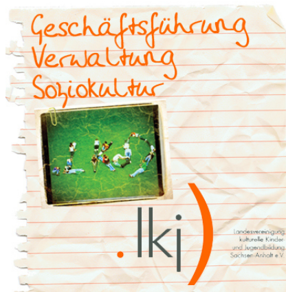
Management board / administration / Socioculture