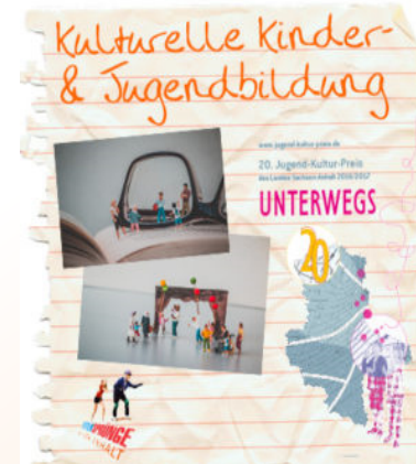
Cultural child and youth education