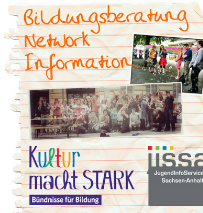
Educational counselling / Network Information