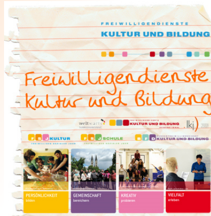
Cultural and educational voluntary service