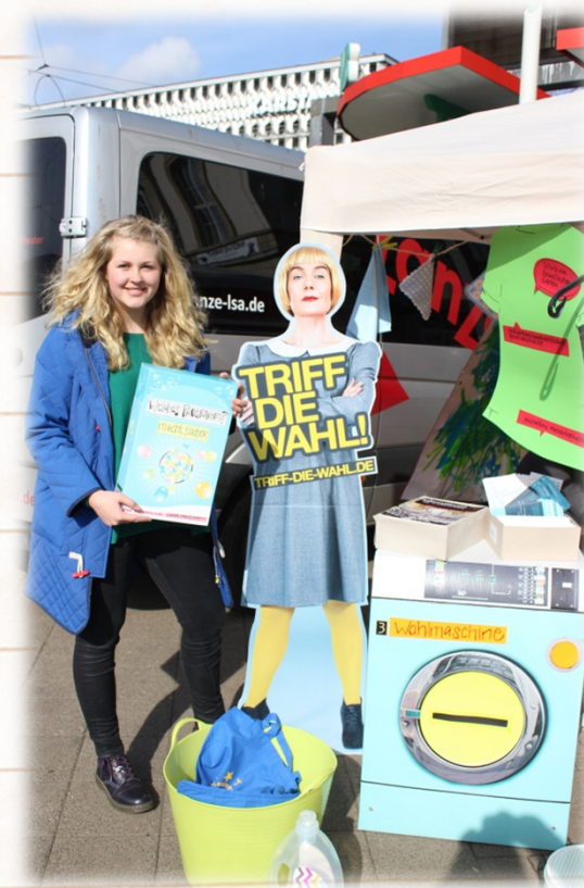
Youth elections 2016