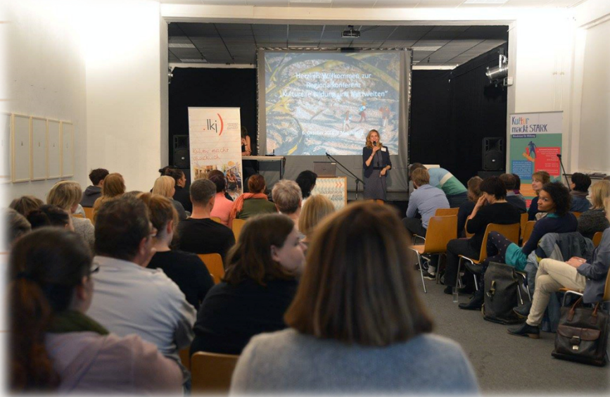
"Cultural education and network worlds" conference in October 2016.