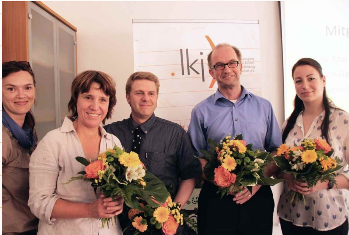
Voluntary Committee 2014-2017