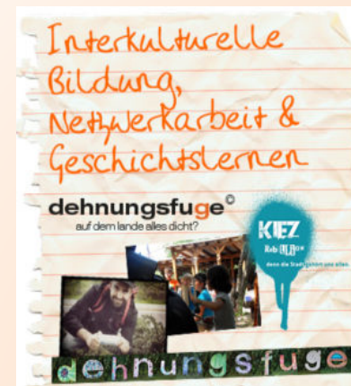
intercultural education, networking and learning about history